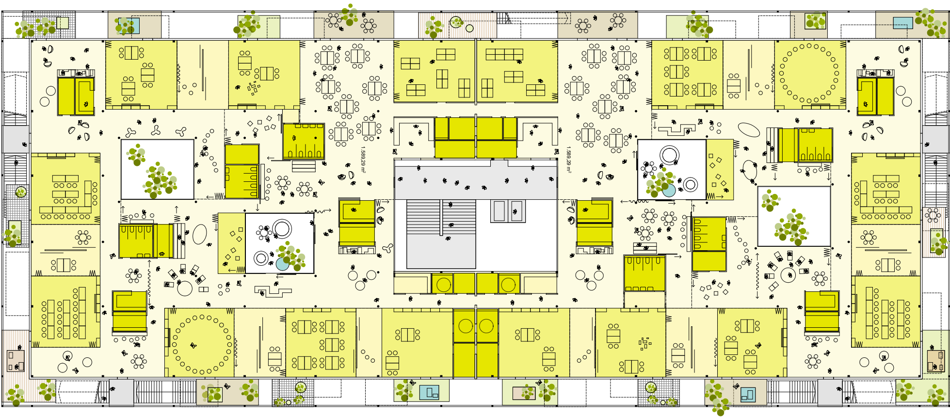
floor plan 1:400